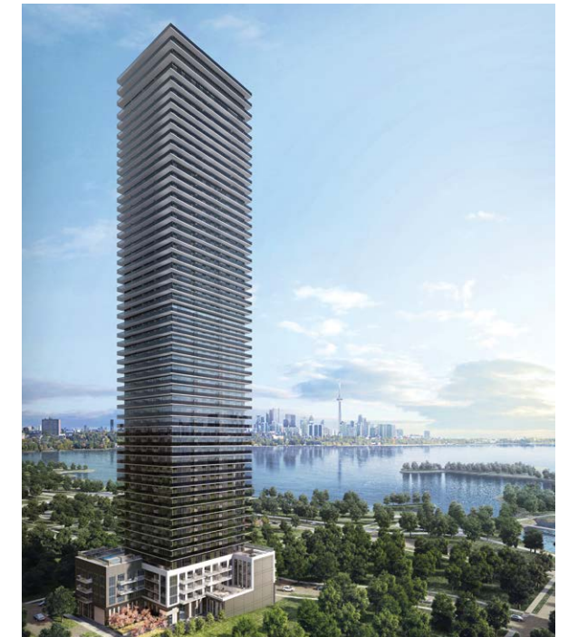
Vita on the Lake, Toronto