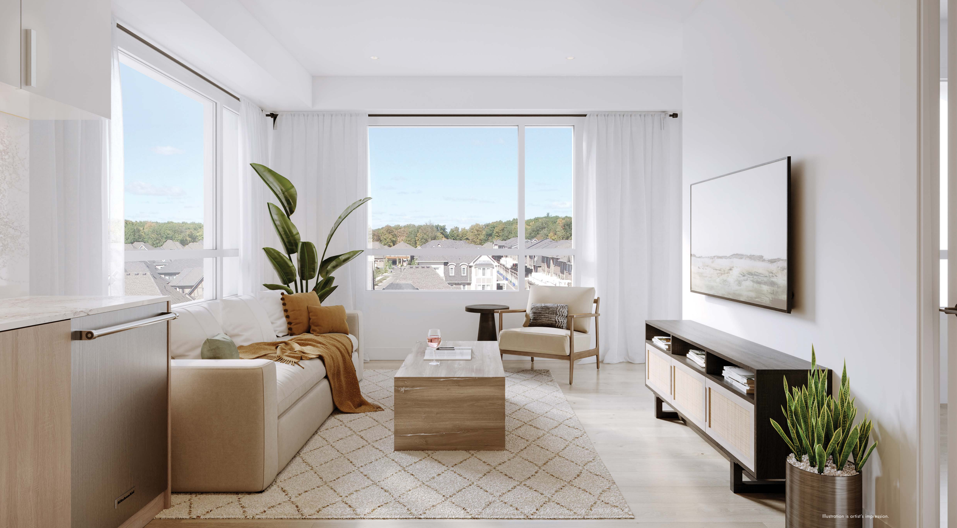
Illustration is artist's impression.

From weekend brunches and blissful naps to the hectic rush of weekday mornings, the suites speak to the way you want to live and meet the demands of every pace of life.