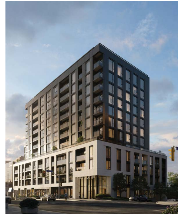
Westbend Residences, Toronto