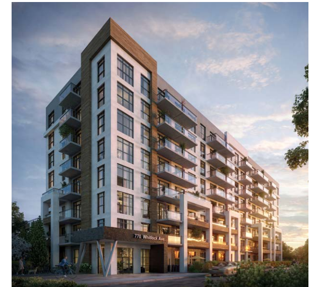
Mile + Creek, Milton