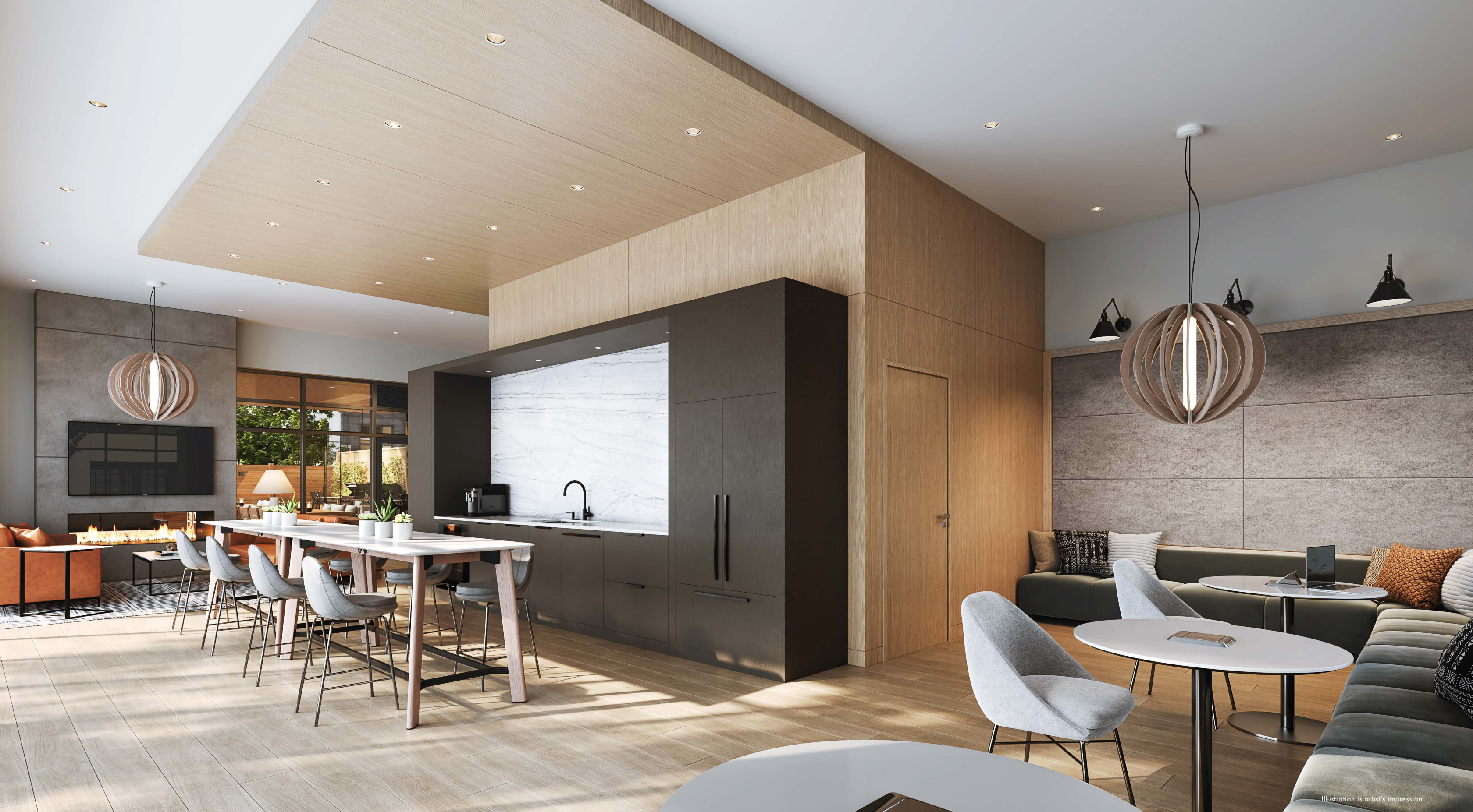
Illustration is artist's impression.

Warm and welcoming, the multipurpose Social Lounge is waiting to greet you. This versatile space is both a comfortable co-working spot and an ideal location to host your next gathering. Outfitted with a dining area, prep kitchen and fireside seating, it is perfect for entertaining.